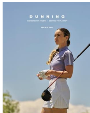
SPRING 2025 WOMEN'S